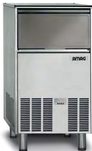
Model SCH 65