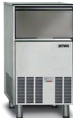
Model SCH 50