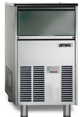
Model SCH 30