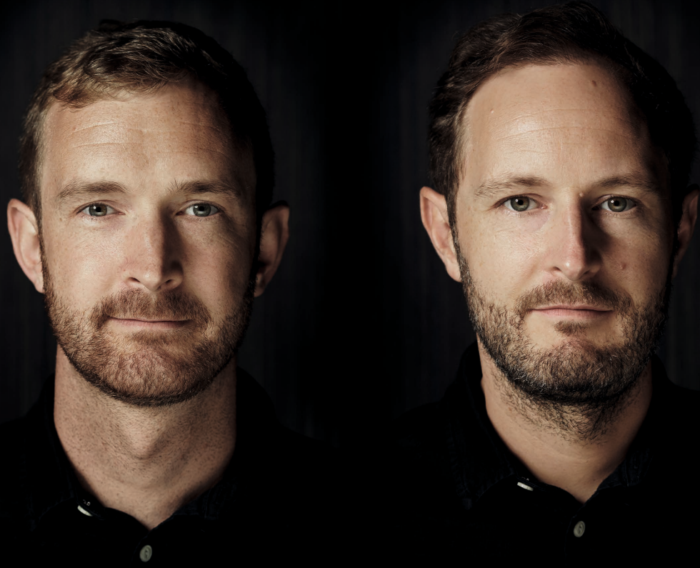
Inventor & CEOs